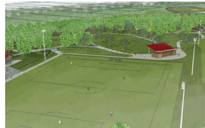
Project Legacy, 2013 - Soccer Area

This information was then used to explore an opportunity for naming right donors and to apply for grants to fund construction. For a number of reasons, neither of these funding opportunities were realized at that time.