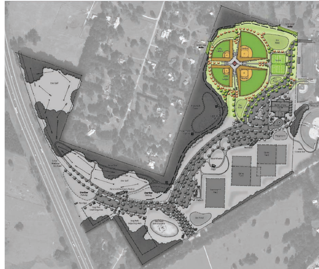
Phase: Northern Areas

This phase of development includes construction of the three multi-purpose fields, the amphitheater, the playground (if not installed in Phase 1), and support elements including a restroom building, the concessions/scoring/restroom building, permanent stadium bleachers, and walks and parking. If site work and grading for sports fields were included in the first phase, then they would be enhanced with sports turf, irrigation, and sports lighting within this phase of work. If it was not included, site work and storm water improvements would represent a significant portion of this phase. In addition, much of the site work of this phase represents a grading cut that would provide valuable fill dirt needed for construction of the baseball and tennis complexes. The wet retention pond would be installed within this phase, and the roundabout would also be installed to replace