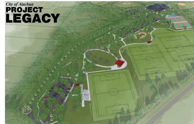
Project Legacy, 2013 - Master Plan