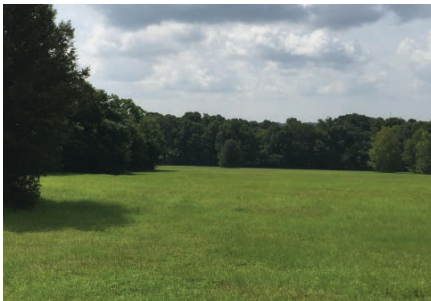
Legacy Park – Existing Fencerow

One of the most significant natural features of the property is the over sixty feet of elevation difference between the site’s highest point and eastern and southern property edges along the Hal Brady Recreation Complex and Peggy Road, respectively. Existing grade falls at approximately five percent across much of the site, resulting in a gentle, rolling character. Lack of natural drainage at a low point between the existing football and baseball fields creates minor drainage issues, which ideally should be addressed within the proposed storm water design of Legacy Park. Future development should integrate proposed site improvements into the existing grade as much as possible so that the character of the property can be maintained.