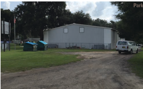
Hal Brady Recreation Complex – Back of Existing Recreation Center