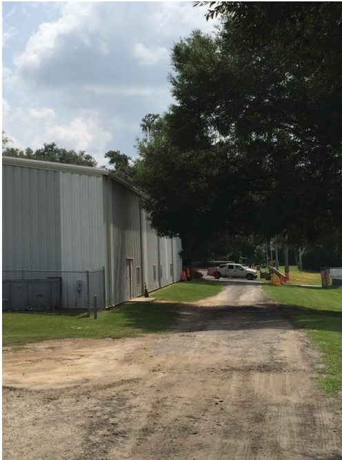
Hal Brady Recreation Complex – Existing Maintenance Drive