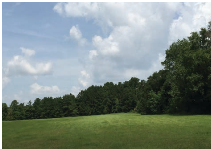
Legacy Park – Northern Property Edge

The site is currently undeveloped and includes large areas of rolling pasture edged with native forest along most property boundaries. Old fencerows of Live Oak and other native tree species cut across the site and frame open areas. It is the City’s desire to save as many larger, high quality trees as possible to preserve the site’s natural character and to offer an instant buffer between existing homes and future recreational use. Preservation of trees will likely only be possible within those areas of the site in which the existing elevation is not altered.