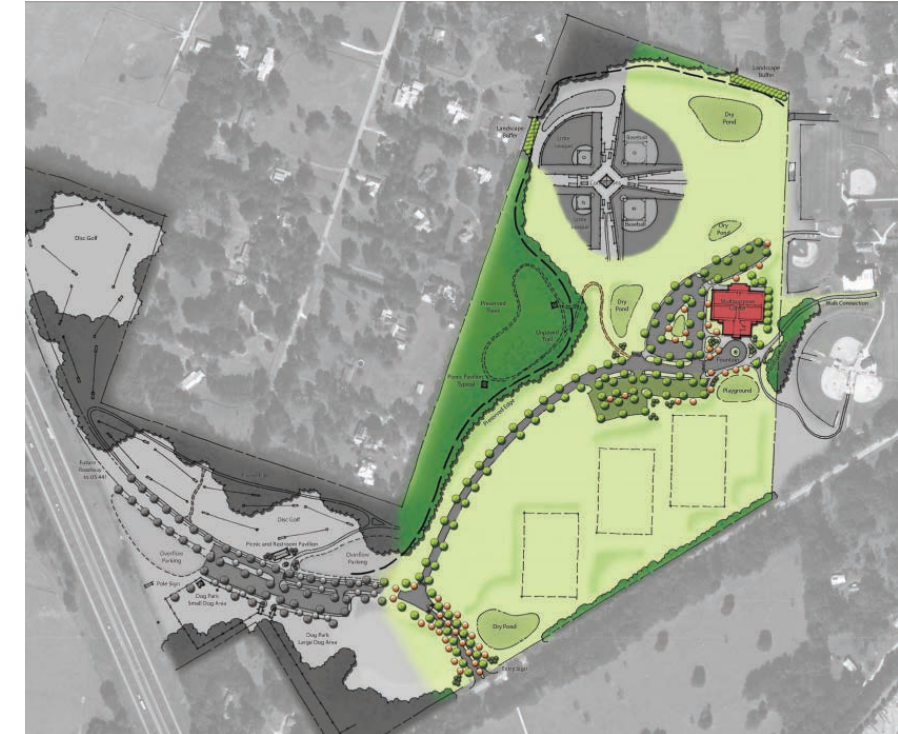
Phase 1 Plus: Extension of Grading for Open Space