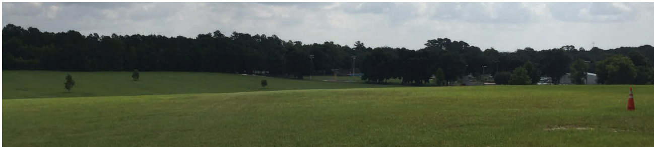
Legacy Park – Site, Facing East towards Hal Brady Recreation Complex

One of the most significant natural features of the property is the over sixty feet of elevation difference between the site’s highest point and eastern and southern property edges along the Hal Brady Recreation Complex and Peggy Road, respectively. Existing grade falls at approximately five percent across much of the site, resulting in a gentle, rolling character. Lack of natural drainage at a low point between the existing football and baseball fields creates minor drainage issues, which ideally should be addressed within the proposed storm water design of Legacy Park. Future development should integrate proposed site improvements into the existing grade as much as possible so that the character of the property can be maintained.