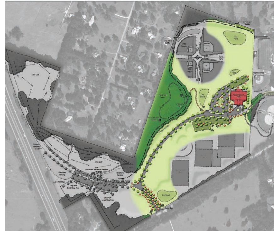
Phase 1: Multipurpose Center and Entry Drive

Utilities installed under the entry drive within this phase are sized for future needs to prevent reconstruction of the roadway in the future. Dry stormwater ponds and stormwater inlets and piping are provided as needed and located as per future development needs. One of the largest components of this phase is the amount of site work and grading required for construction of the above while tying back into existing grade at a three to one slope, maximum. It is anticipated that the total order of magnitude construction cost of this phase may be approximately $9,175,000.