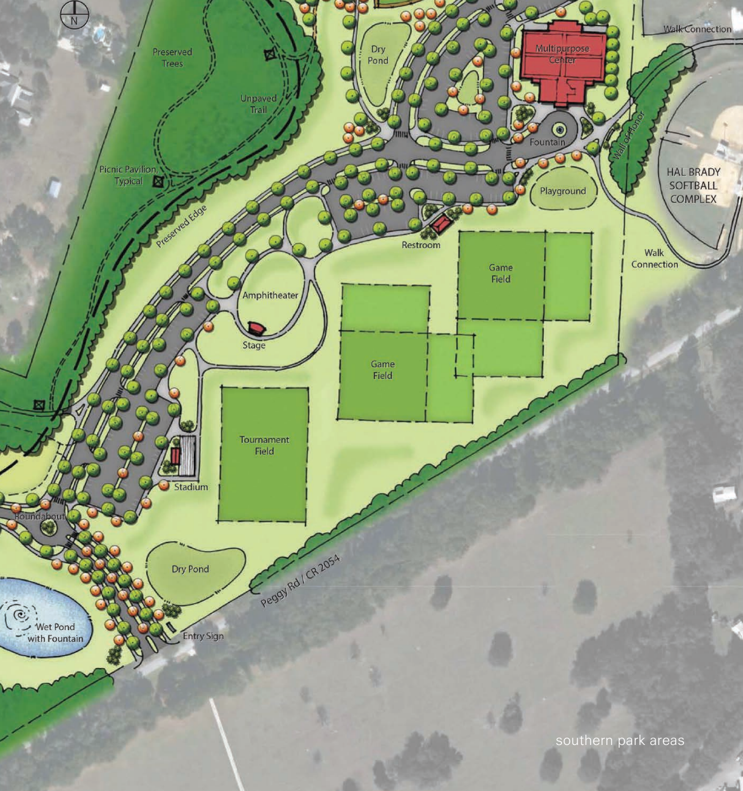
southern park areas