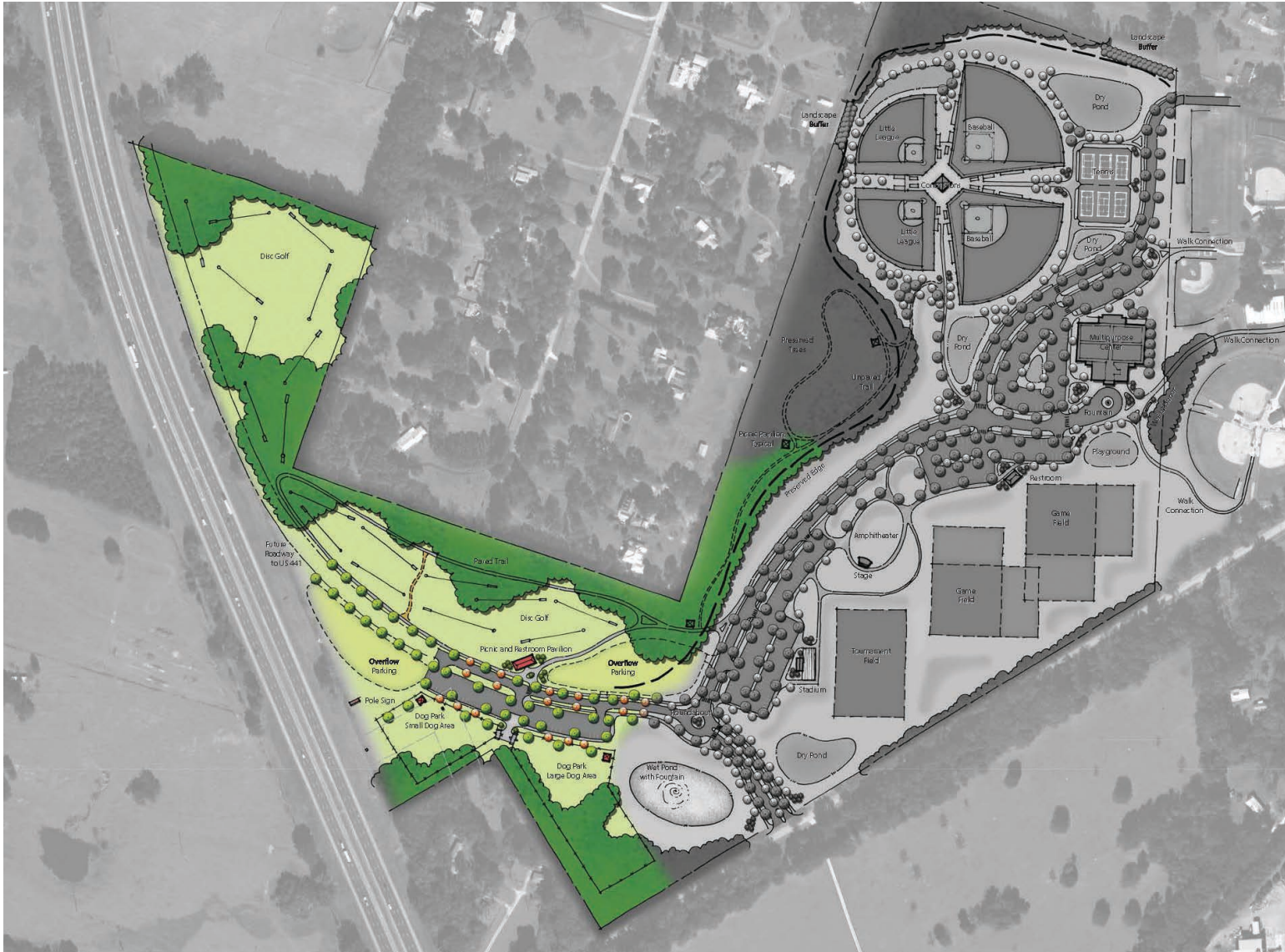
Phase: Western Areas

A proposed pole sign will be included at a location along the edge of proposed western overflow parking that offers best views from I-75 traffic. Like previous phases, code-compliant landscape and irrigation would be included as would utility services to the restroom/picnic pavilion and to the entry to the dog park for possible dog wash stations. It is anticipated that this phase represents a total order of magnitude construction cost of approximately $2,000,000.