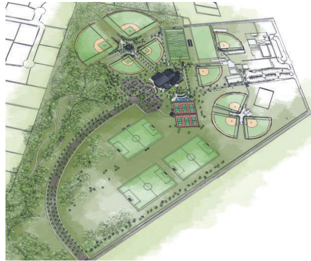
Project Legacy, 2010

In 2010, the City of Alachua explored the opportunity to purchase property directly adjacent to the City's premier community park, the Hal Brady Recreation Complex. The 105-acre site represented the only possibility for future expansion to the otherwise land-locked Hal Brady Recreation Complex and was large enough to allow for development of much needed active and passive recreation. The property had been previously approved for development of a 200-home residential community, the construction of which would have severely impacted the site's highly valued natural character. Due to the potential for this site to uniquely expand the City's most used park, an aggressive fundraising campaign was launched to purchase the property. 'Project Legacy' was envisioned as a local and regional park that would provide for the growing recreational and cultural needs of citizens of Alachua while protecting valuable natural areas of the property and supporting continued event use, including the Babe Ruth World Series and Fourth of July festivities. An initial park program and master plan design were developed to demonstrate this potential to citizens and possible donors. The property was purchased for $1,150,000 in 2012 through funding by the Wild Spaces, Public Places surtax, the Alachua County Tourist Development Tax fund, and several private donors.