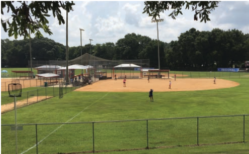
Hal Brady Recreation Complex – Existing Softball Complex