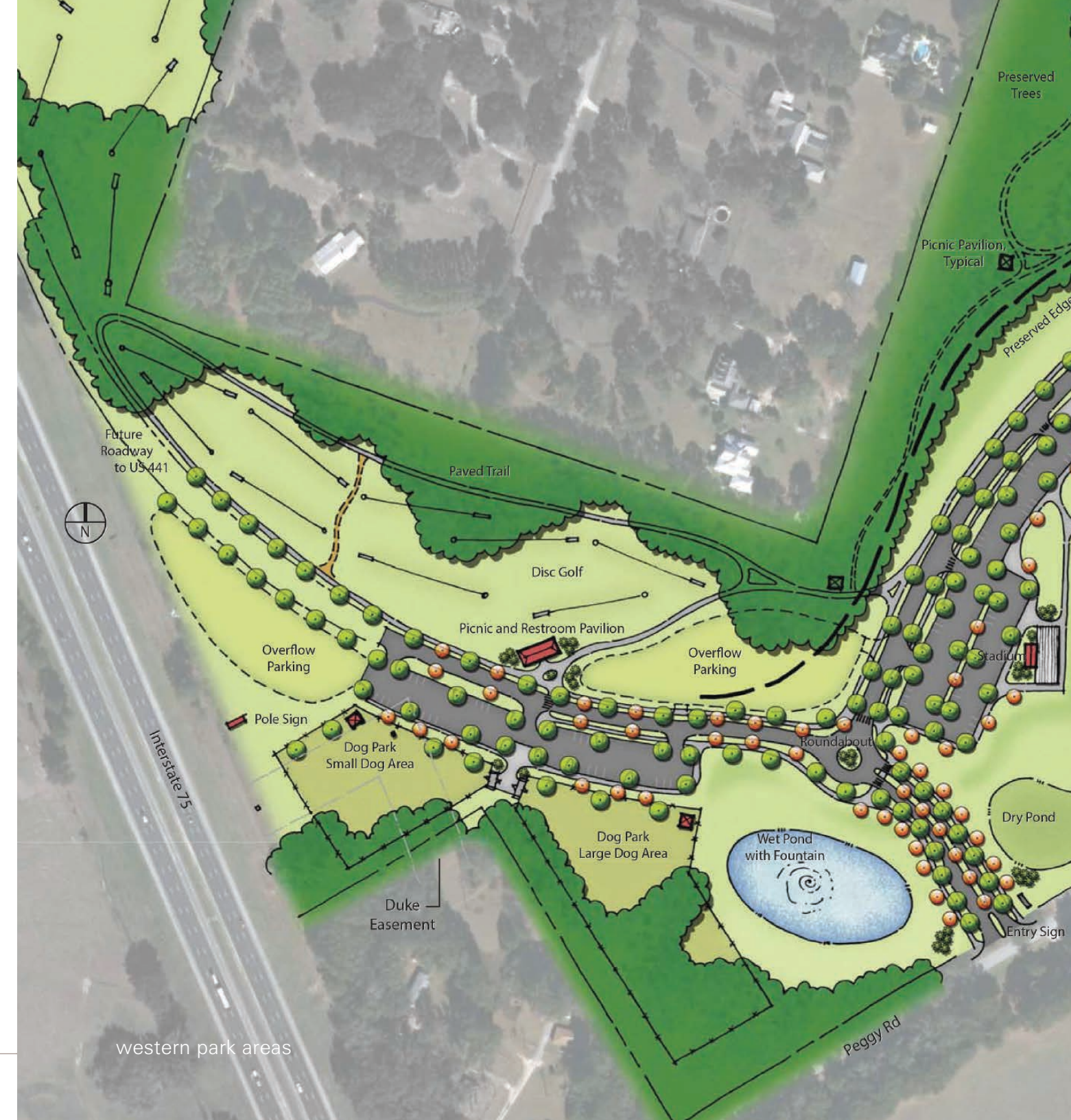
western park areas

Directly across the drive from the dog park is the first hole of an eighteen-hole disc golf course. Holes are located to fit into the site's natural grade and around preserved trees. Forest areas between the park's edge and the adjacent neighborhood is preserved, and a paved trail skirts the tree line to offers views of natural areas as well as the disc golf course. The park's overall trail network ends in a comfortable loop around the front nine disc golf holes and represents the end to an over one mile-long trail route provided entirely within the park.