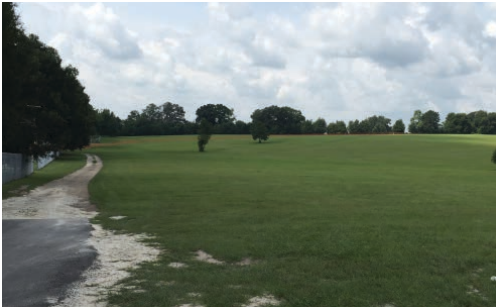
Legacy Park – Looking North from Terminus of NW 145th Avenue

Existing uses along the eastern property edge that is contiguous with the Hal Brady Recreation Complex consist of a football field to the north, a central baseball field and playground, and a softball complex to the south. Good views of these areas are possible from Legacy Park due to existing topography, and design of future improvements should look for ways to preserve these sight lines. Walks and maintenance paths between new and existing park areas should also be