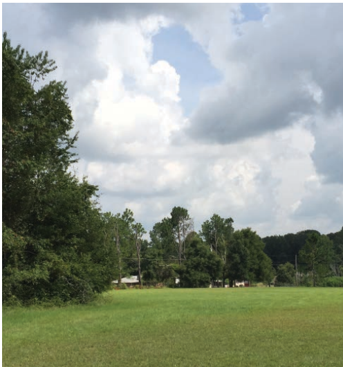
Legacy Park – Western Edge along Neighborhood

added to best connect areas and provide the most efficient overall use of park spaces. Historically viewed as ‘the back’ of the Hal Brady Recreation Complex, these westernmost areas of the Complex have several features that currently face away from Legacy Park. Opportunities to change circulation routes or relocate or screen back of house items such as dumpsters and condenser units of the existing recreation center should be considered in order to better connect the two parks. A small maintenance area is located between the baseball field and softball complex along this edge and is accessed via an unpaved maintenance drive running along the southern edge of the existing recreation center. This existing drive has the potential to turn into a main pedestrian connector with Legacy Park as it is centrally located and well-positioned to serve both the front door of the existing recreation center and the main paved parking area of the existing park. Additionally, screening or relocation of existing maintenance and dumpster areas should be considered.