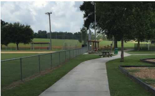
Hal Brady Recreation Complex – Existing Walk Leading to Legacy