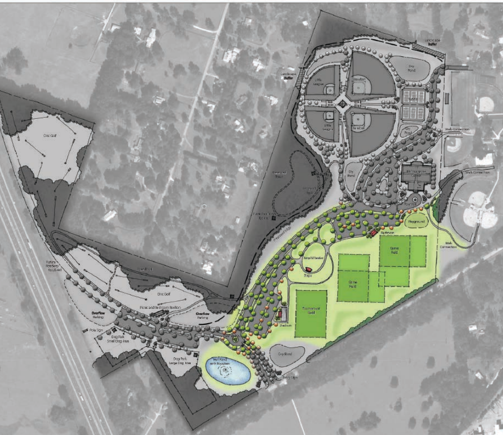
Phase: Southern Areas