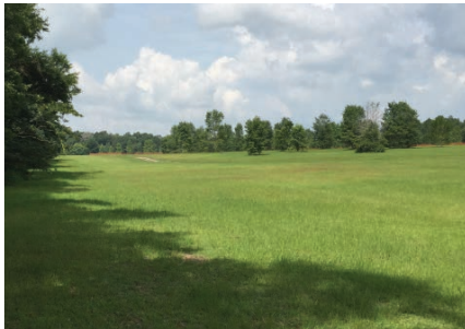
Legacy Park – Site, Southern Edge