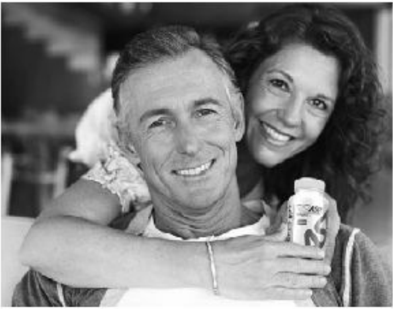
Big Pharma Worried: Older men are having better sex after taking new JackedUp pill. Clinical trials show active ingredient triggers surge in desire, strength of erections, and sexual activity in older men.

Recent clinical trials on JackedUp’s active ingredient have made the drug companies more desperate. The trial results were published in major medical journals, and doctors are now recommending JackedUp to patients.