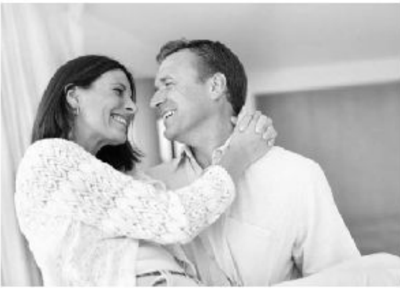
New men's pill overwhelms your senses with sexual desire as well as firmer, long-lasting erections. There's never been anything like it before.

Because you don't need a prescription for Vesele", sales are exploding. The maker just can't produce enough of it to keep up with demand. Even doctors are having a tough time getting their hands on it. So what's all the fuss about?