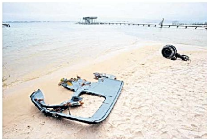
A wheel and pieces of fuselage from an Army Black Hawk helicopter were washed up on the shoreline of Santa Rosa Sound near Navarre on Wednesday.