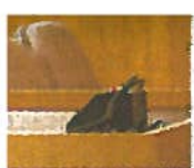
Alachua County Today asks before the board to express smart store in