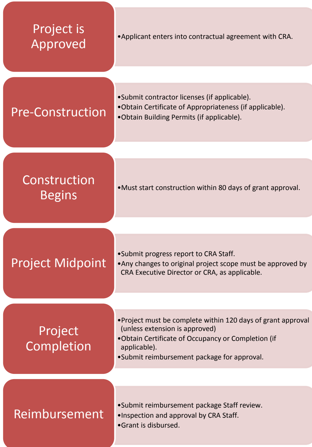
Figure 2: Grant & Project Steps