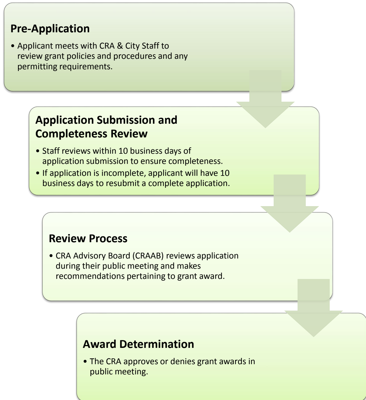
Figure 1: Application Steps

The award of a grant must meet all public record requirements (including the right to audit) and other public purpose actions and findings necessary to establish the foregoing. For details about Florida Public Records law requirements (F.S. 119) please see Appendix C.