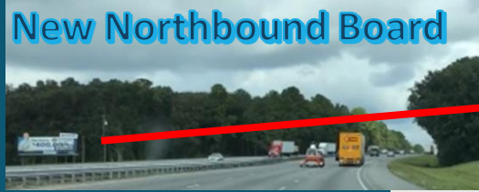
New Northbound Board