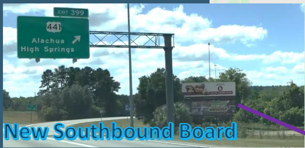
New Southbound Board

New Southbound board prior to I-75 & I-10 junction